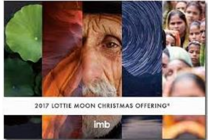
Providing Financial Support to Missionaries as they Spread the Gospel Overseas

Please be in prayer for this upcoming emphasis on foreign missions